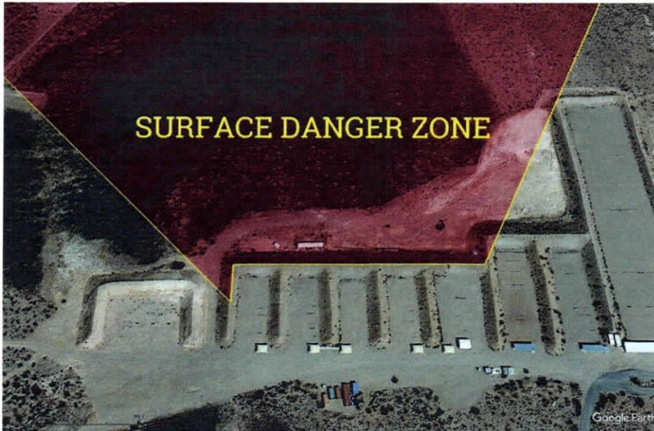
Figure 1. Bay 1-5 Surface Danger Zone